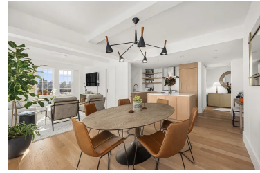
One of a Kind 2 Bedroom Rented!