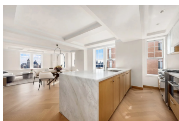
360 Central Park West In Contract