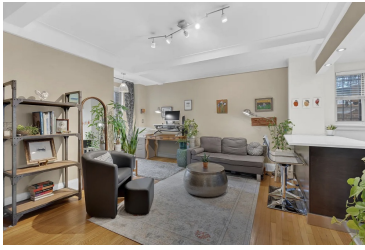
UWS Pre-War One Bed Sold!