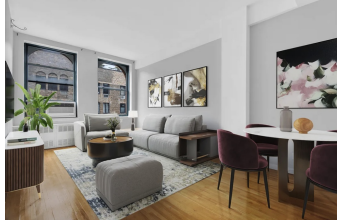
Greenwich Village Loft In Contract