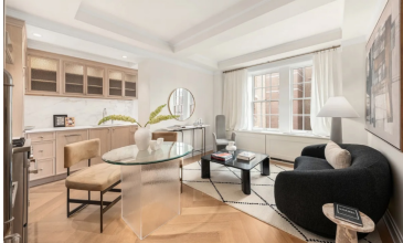
Mint One Bedroom Sold!