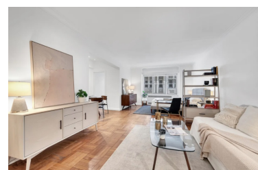
220 Madison Avenue In Contract