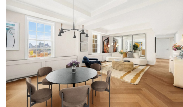
Rare High-Floor Sponsor Unit In Contract