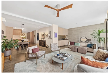
Stunning Luxury in City Hall In Contract